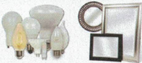
Light Bulbs & Plate Glass/Mirrors