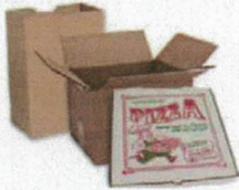
Cardboard & Pizza Boxes Flatten cardboard. Remove wax paper from pizza boxes