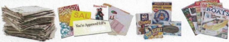
Newspaper, Office Paper, Paper Bags, Junk Mail, Paperboard & Magazines

Paper Place loose in cart. Use clear plastic bags for shredded paper ONLY .