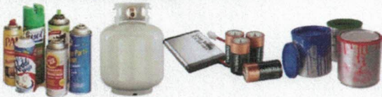
Aerosol Cans, Propane Tanks, Batteries & Paint Cans