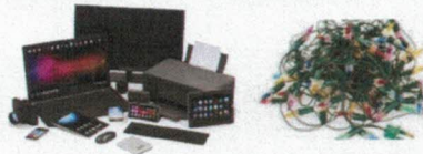
Electronics, Cords & Christmas Lights