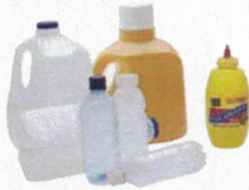
Jugs & Bottles with Small Top Openings