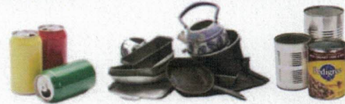
Aluminum Cans, Metal Cookware, Steel & Tin Cans