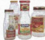
Clear Bottles & Jars