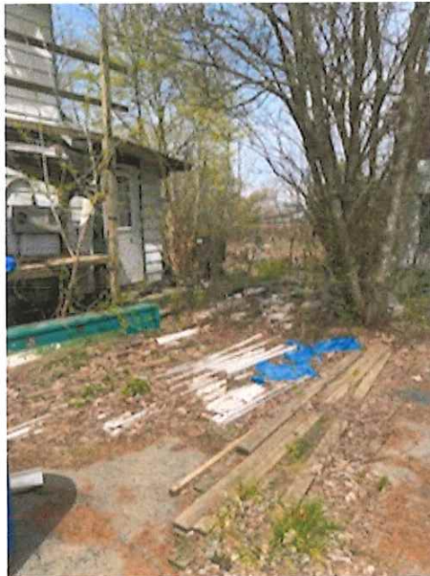
#4 Binds. 2920 - Side view of house