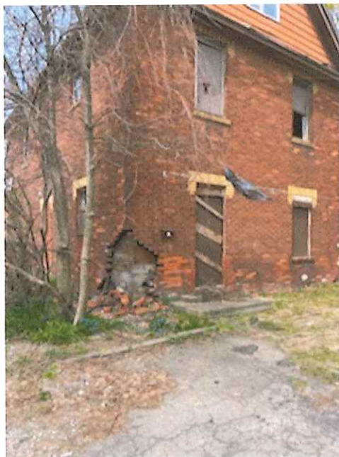
3015 - Hyde Park backcorner