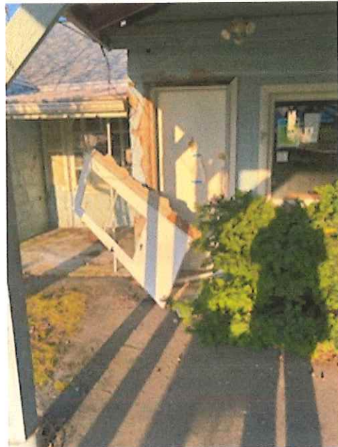
3207- Portland front door